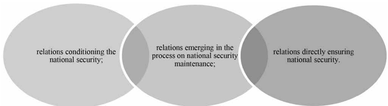
Figure 1. Relations that make up the contents of national security.

Analysis of the national security sphere requires defining and establishing the circle of social relations that makes up its contents, and which includes the relations listed in the Figure 1.