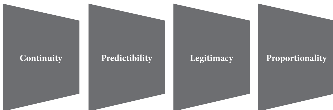
Figure 2. The main strategic principles of Romania with NATO

The basic strategic principles underpinning Romania's strategy with NATO are presented in Figure 2.