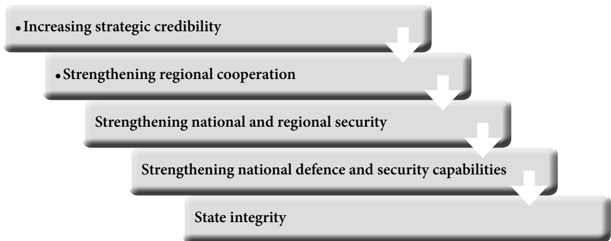
Figure 1. Main strategic objectives of Romania with NATO