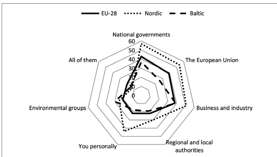
Fig. 2 Who within the EU is responsible for tackling climate change?, % (multiple answers possible)

The main goal of this article was to identify how people in Baltic – Nordic countries perceive the institutional responsibilities in climate change adaptation and mitigation. Figure 2 presents the attitudes of public towards the institutional responsibilities for tackling climate change. There were multiple answers possible, so the results indicate the broader perception of responsibility share.