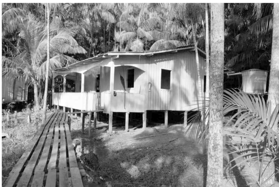
Figure 1. A raised walkway leading up to a house on stilts (Note: when the tide is high, the water reaches far beneath the building)

The close proximity to the sea means the vast river which surrounds Paquetá and neighbouring islands is tidal. As such, individual and small clusters of households which are predominately located along the island shores and interior waterways are built on stilts. Raised walkways lead up from the river and connect clusters of buildings, or lead to separate toilet blocks that are located away from the main structures (Figure 1).