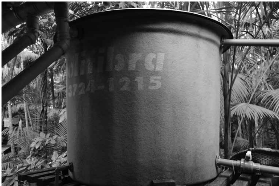
Figure 2. Rainwater harvesting installation on Jutuba

Unlike the activities and public services listed above, the provision of drinking water has the potential to be independent from the tidal cycle of the river. The island of Cotijuba, which is more developed, has a borehole that supplies the island with drinking water, as well as grid electricity and road infrastructure. However, on Paquetá and other islands access to clean water remains a challenge. In these areas, the dispersed location of households means that off-grid solutions are likely to be the most appropriate solution for the provision of drinking water. This is already reflected by the widespread use of water infrastructure that collects river and/or rainwater at the household level. Those living on the islands of Arapiranga, Mucura and Onças depend on river water for decentralised supply at household level which is pumped into raised tanks and distributed using gravitational force. Discussions with the local community indicated that common health issues on Arapiranga include vomiting and diarrhea. It is likely that these problems are linked to the poor quality of their drinking water, though people across the islands also regularly come into contact with river water when they bathe in it.