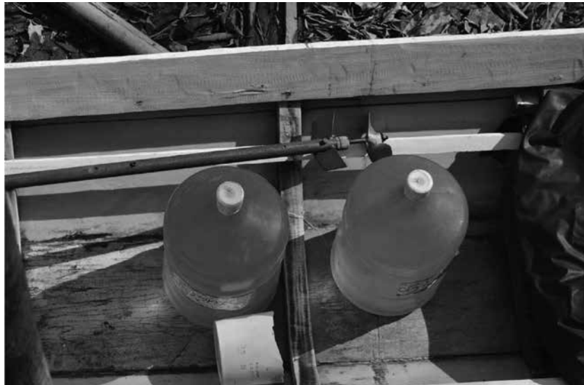
Figure 4. Bottled water supplements drinking water during periods of low rainfall.